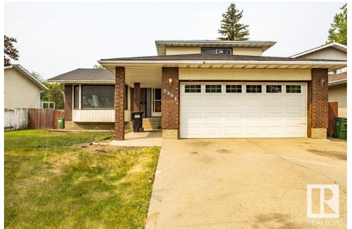
2208 85 St NW, Edmonton, AB

Basement (Below Grade) Exterior Area 1036.32 sq ft Interior Area 853.53 sq ft Excluded Area 94.86 sq ft