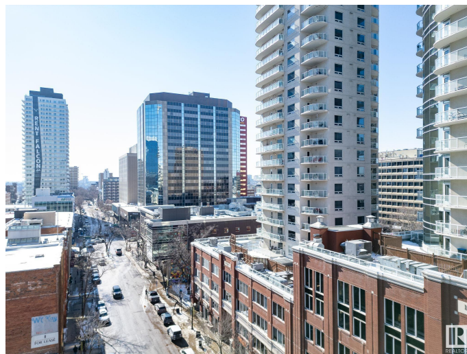
701-10136 104 Street NW, Edmonton, AB