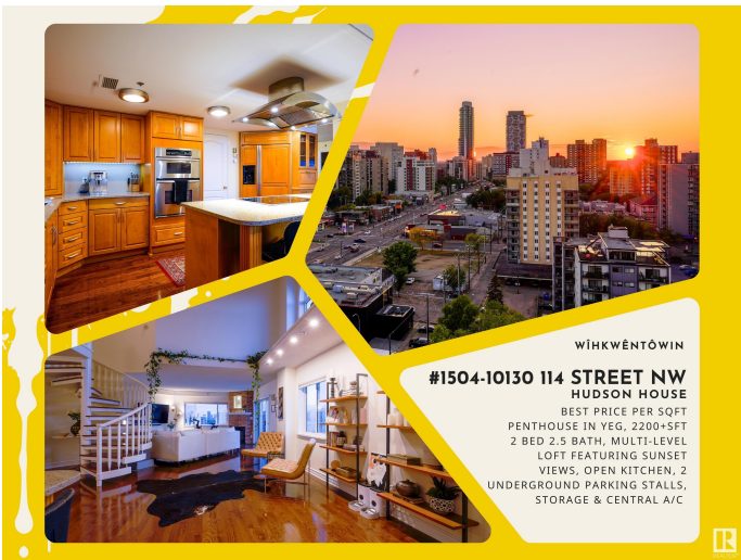
#1504 10130 114 STREET HUDSON HOUSE OLIVER, EDMONTON